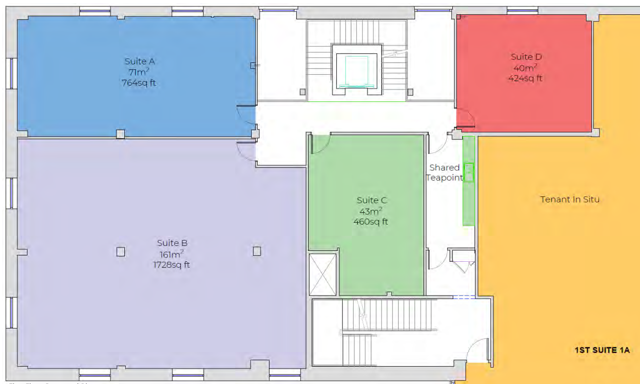
First Floor Proposed Plan